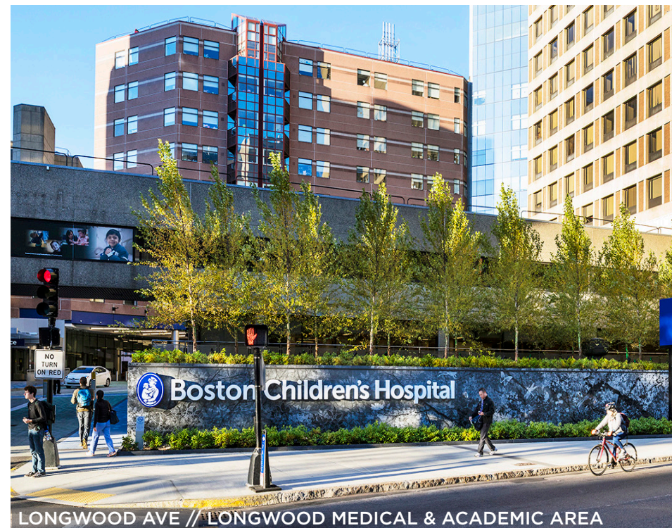
LONGWOOD AVE // LONGWOOD MEDICAL & ACADEMIC AREA